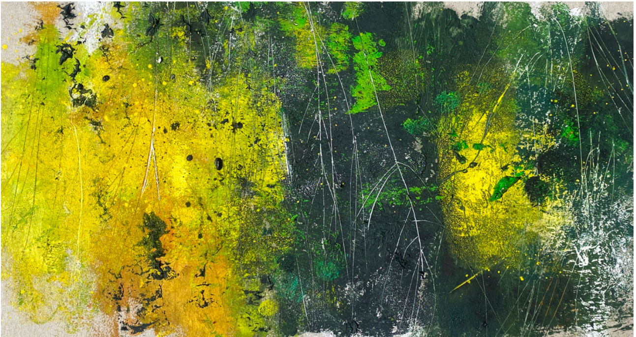
Willow, 2022, Oil on panel