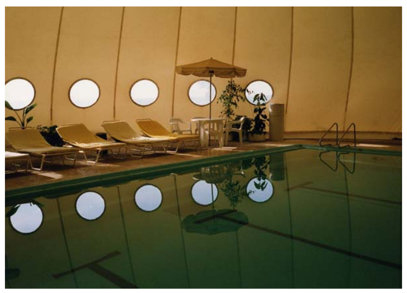
Tel-Aviv, Israel, 1989, C-type print, 23.5 x 31.3 cm

This body of work, available exclusively with Flora Fairbairn & Co, spans some 40 years, and offers Bohm's unique perspective on a rapidly changing world.